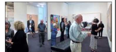
Above: Visitors enjoying the Exhibition.