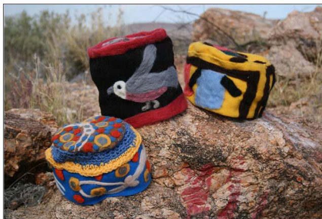
Image: 'Spirit ladies from the desert', Sharon Alice, 2010. 'Galahs', Betty Conway, 2012. 'Hanging out the washing', Rhonda Napanangka, 2012.

An exhibition embraced by a broad cross section of the community, the collection will inspire audiences to laugh, don crazy headwear and bring out those knitting needles all over again. A touring exhibition from Art Back NT.