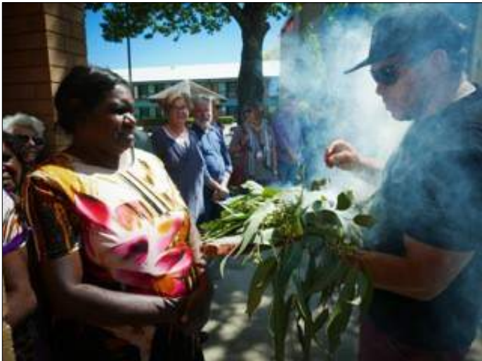
Smoking Ceremony.

Hosted by Cowra Regional Art Gallery and presented by Artback NT, Punuku Tjukurpa is an exhibition showcasing a rich, sacred history and deserves national attention.