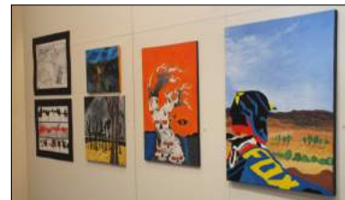
2015 Exhibition scene.

Exhibition opening and announcement of the award winners is on Sat 26 Nov commencing at 2pm.