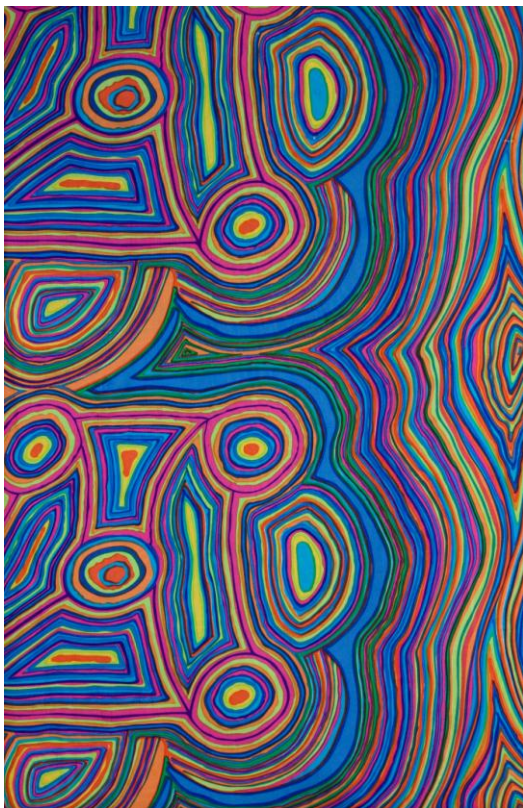
Jimmy Pike, Jila Japingka, c.1986. Silk. Courtesy of Desert Designs.

Born in the Great Sandy Desert around 1940, Pike lived a traditional Walmajarri life for most of his childhood. As an adult, while serving time in prison, Pike joined art classes and before long his work was capturing the explosive beauty of the harsh desert landscape with bold forms and non-traditional colours.