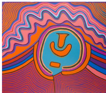
Jimmy Pike Grandfather and Grandson , 1989. Colour screenprint.

This significant touring exhibition features paintings, prints and textile designs including fashion garments by Jimmy Pike made in the '80s during the height of the Indigenous cultural renaissance.