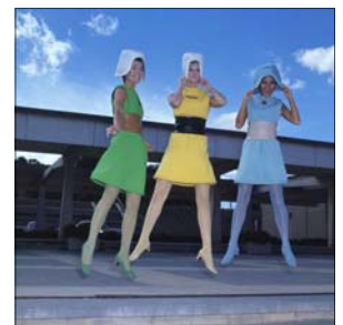
Pierre Cardin Fashion Parade at Canberra Theatre Centre 1967.

From mini skirts of the 1960's, to the bohemian fashions of the late 1970's, this vibrant, colourful and quirky exhibition explores the glamorous world of Australian Fashion. A National Archives of Australia touring exhibition, supported by Visions of Australia, a Commonwealth Government Program.