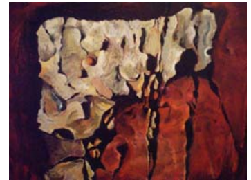
Judy Cassab Pedestal (detail) 1985 Oil on canvas