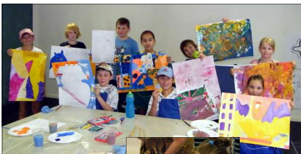
At left: The pm painting group and their creations.