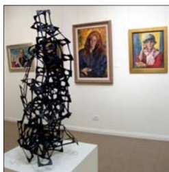
Above: Sculpture John Seed Tethus 2009 Galvanised painted steel