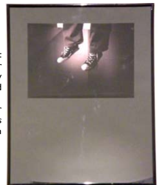
Right: Winner Photography Award By Jeffrey Cotter Used to play tennis Photograph

The winner of the People's Choice Award will be announced on 16 December 2009