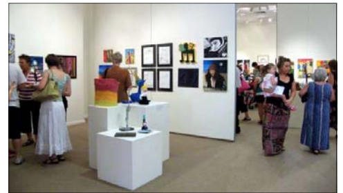
Above: Exhibition opening