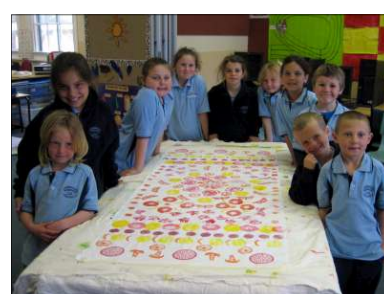
Woodstock Public School