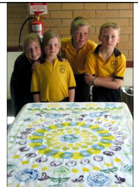
Wyangala Public School