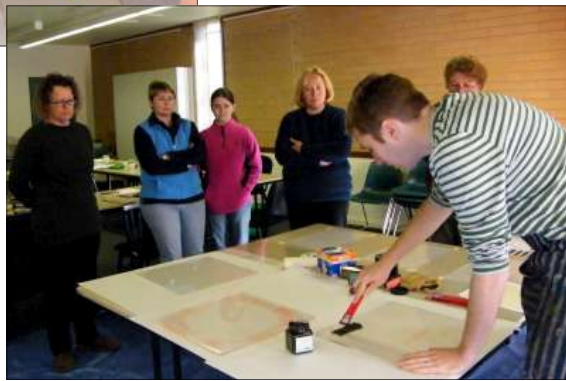
The project was assisted by Museums and Galleries NSW.