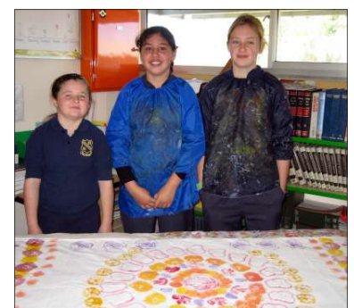
Gooloogong Public School